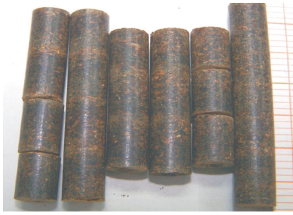
Fig. 3. View of pellets from the mixture of tobacco and lemon balm waste received for parameters of point 8 of the experiment plan ( z_m = 30\% , t_w = 80^\circ\text{C} , l_m = 47\text{ mm} and m_p = 0.9\text{ g} ).

as it is the case with pelletized wood waste, straw, waste generated in the grain and grain-milling industries (Stolarski, 2006), or waste produced during processing oil plants: rapeseed pomace, sunflower husk or peanut shells (Wandrasz, 2007), utilized as components for producing pellets.